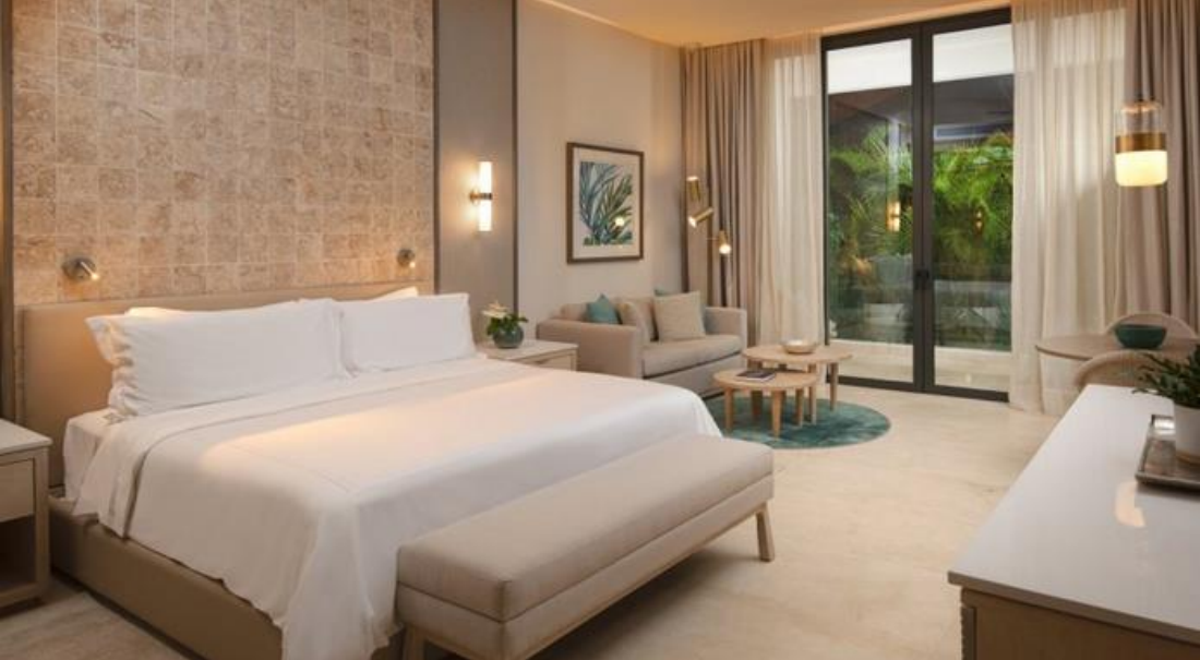
Premier Junior Suites

Enjoy the newest state of the art and over sized luxuriously appointed rooms that will invigorate your senses and provide breathtaking views from your private terrace/balcony