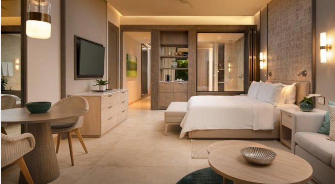
Premier One/Two-Bedroom Suites

Enjoy the newest state of the art and over sized luxuriously appointed rooms that will invigorate your senses and provide breathtaking views from your private terrace/balcony