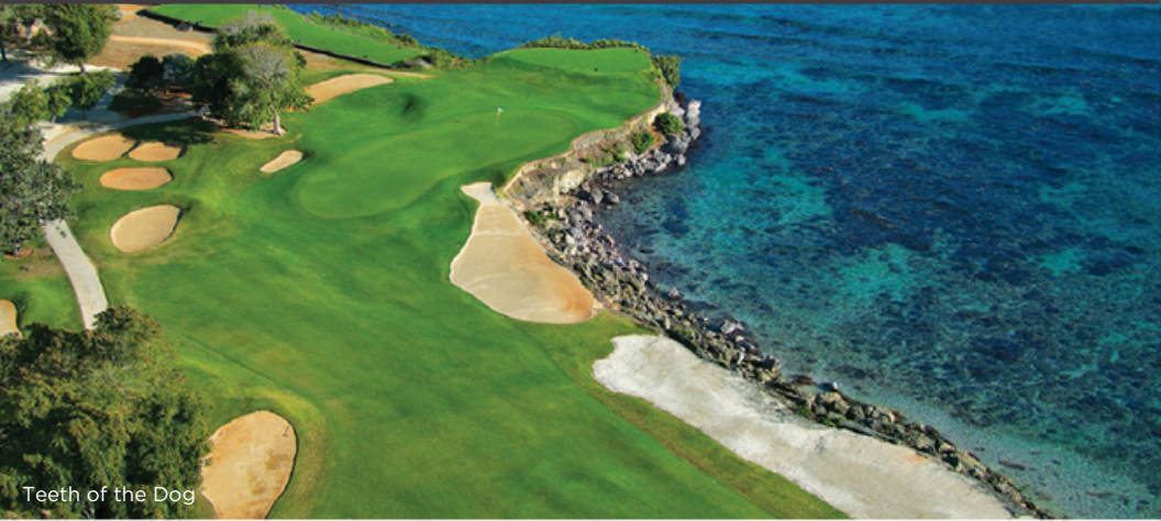
Teeth of the Dog