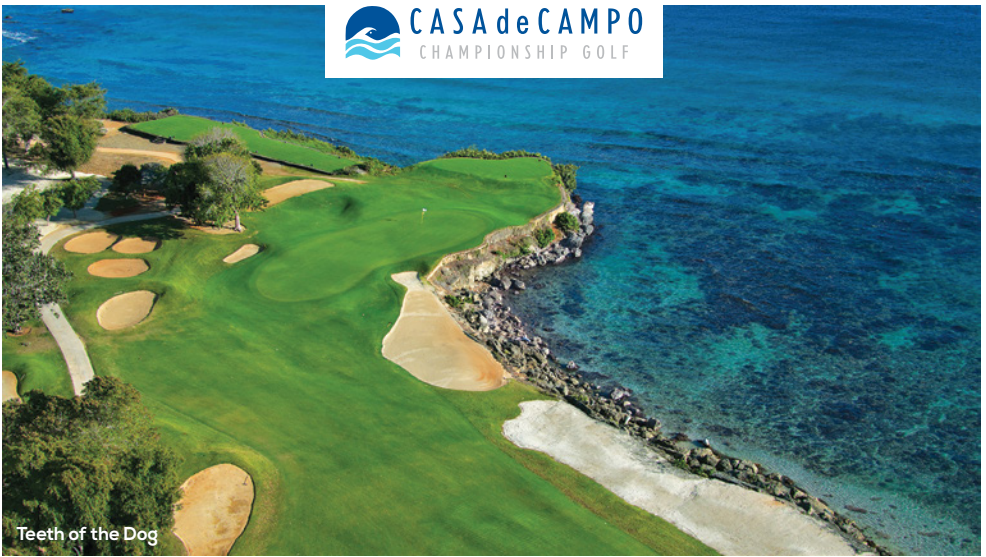
Teeth of the Dog