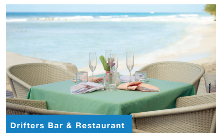
Drifters Bar & Restaurant