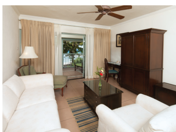
Deluxe Pool Access Living Room