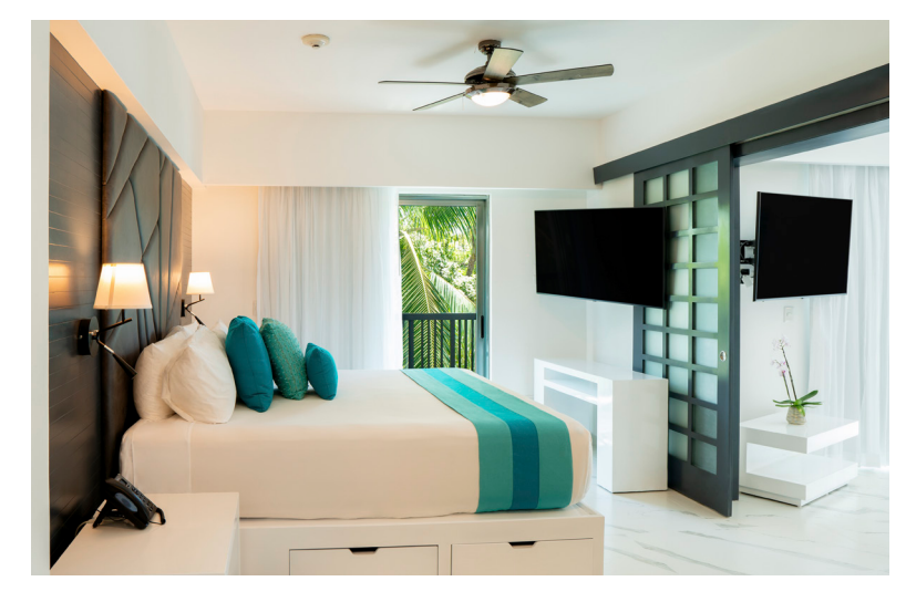
THE FIVES BEACH - PLAYA DEL CARMEN

MAX OCCUPANCY: 10 PAX (MAX ADULTS 8 | MAX CHILDREN 2 )