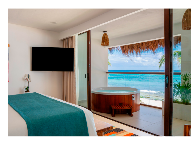
THE BEACHFRONT - PLAYA DEL CARMEN

*Note: Rooms features and views may vary. Some rooms are located directly on the beachfront, while other offer a view of the beach